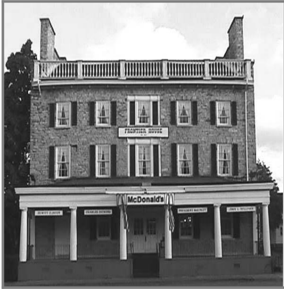
The owner of this building in the Town of Lewiston converted it into a fast food restaurant.

Listing of a property or area on the National and State Registers by itself does not limit the private uses of the property. Owners of property eligible to be listed are sometimes opposed to listing, because they think it automatically regulates what