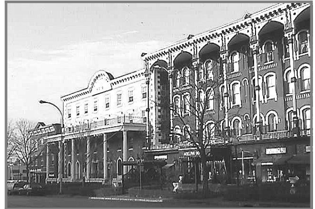
A view of Broadway in Saratoga Springs, New York.

districts, separate historic preservation laws authorized by General Municipal Law § 96-a and Article 5-K are typically used to protect individual