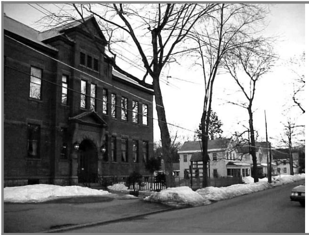
A former public school has been rehabilitated for use as a private school in the City of Saratoga Springs.

ordinance prohibited educational uses from locating in its “Single Family Historic District,” which encompassed the “General Electric Realty Plot,” a distinctive nine-block area of 120 homes developed at the turn of the 20th Century and listed on the National Register of Historic Places. The Court held that because of the competing public policy interests in education, such uses should not be foreclosed from locating in a residential zoning district, even a historic one. The Court further held that there must be a case-by-case deliberative process in which “proposed educational uses must be weighed against the interest in historical