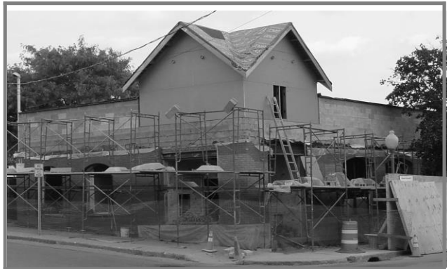
The final results of the remodeling can be seen below. The credit union building is located in Saratoga Springs, New York.