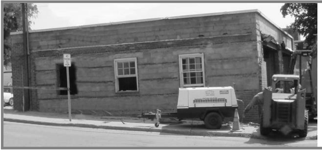
This one-story building in an historic business district is being remodeled to better match the scale and appearance of older structures.

proposed projects in historic areas and require applicants to meet certain architectural requirements. Where an historic zoning district has not been established, a local site plan review law could require that any alterations to designated historic structures undergo site plan review. The standards for review should be established in the site plan review law or ordinance.