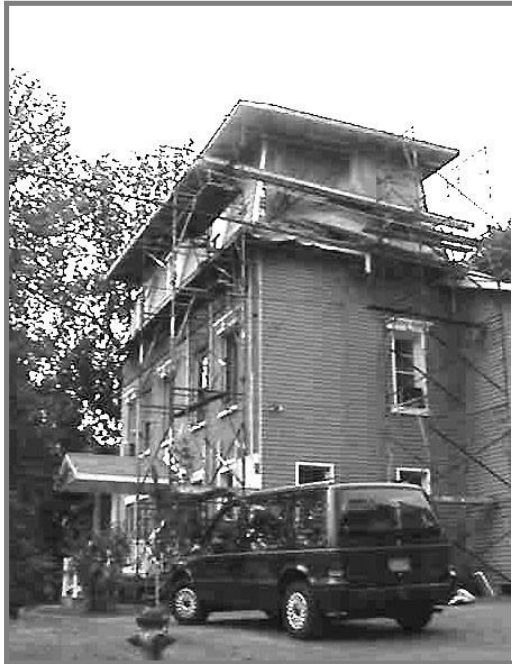
Among the items which can be reviewed by a local board is the materials used in the alteration of an historic property.

Standards for alterations and rehabilitation of historic structures are often borrowed from the United States Secretary of the Interior's Standards for Rehabilitation of Historic Properties. 22 Other sources of information on standards for use by municipalities are the Preservation League of New York State, county and regional planning agencies,