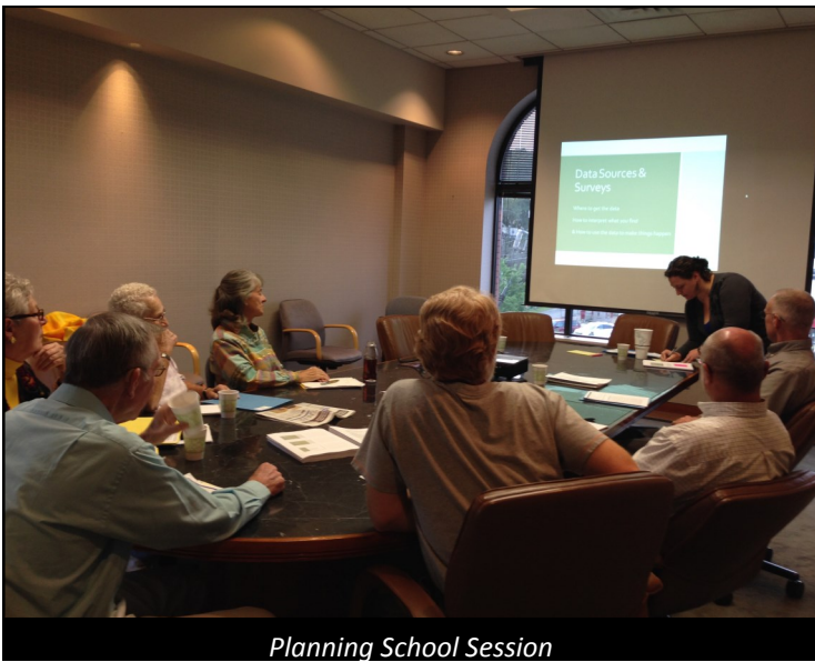
Planning School Session