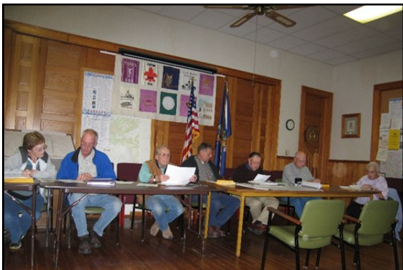
Town of Caton Planning Board